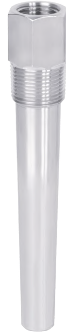
Threaded thermowell, design TW15-H