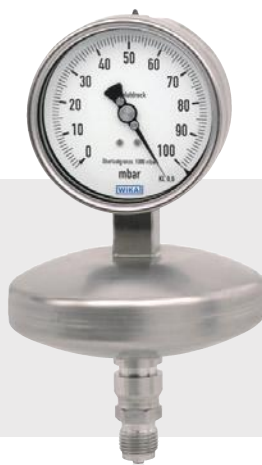
Model 532.51 – 532.54