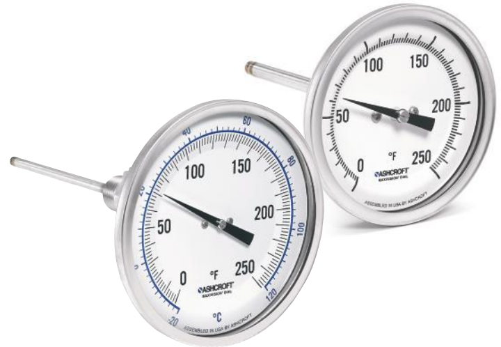
CI Bimetal 2", 3", 5" dial sizes