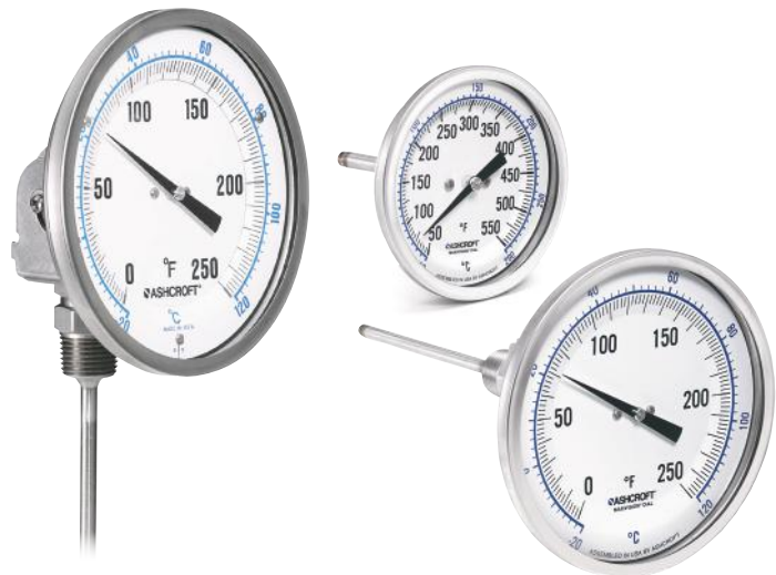
EI Bimetal 2", 3", 5" dial sizes