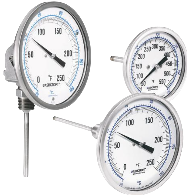
EL Bimetal 3", 5" dial sizes