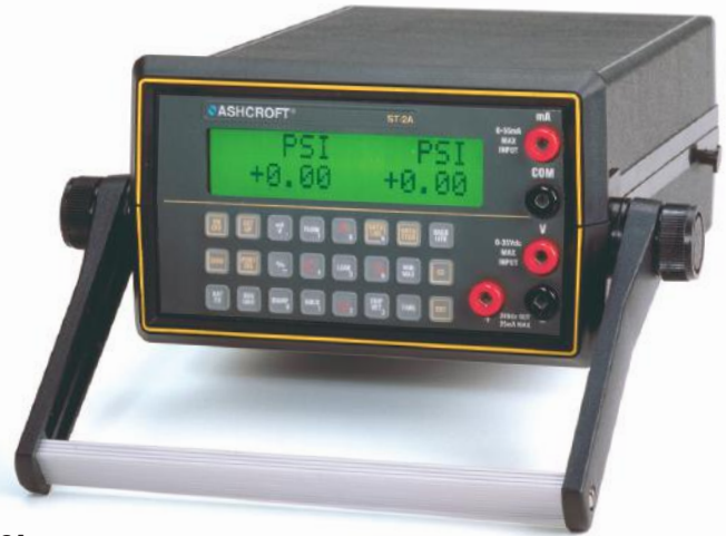
ST-2A Digital Indicator