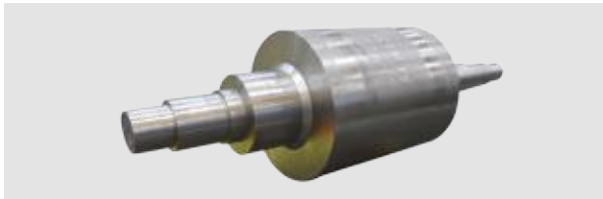
Integral rotor steel forging.

SM40 rotors are manufactured with integral solid salient poles, made from one single steel piece, guaranteeing mechanical strength and stability to the rotating set. The windings, properly fixed to the poles, are insulated with high quality materials.